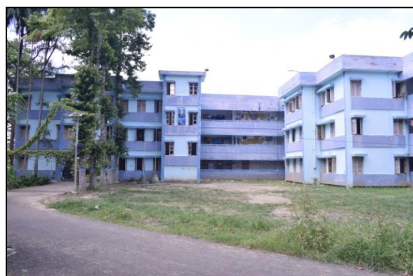
UG Boys Hostel J.C Bose Abas