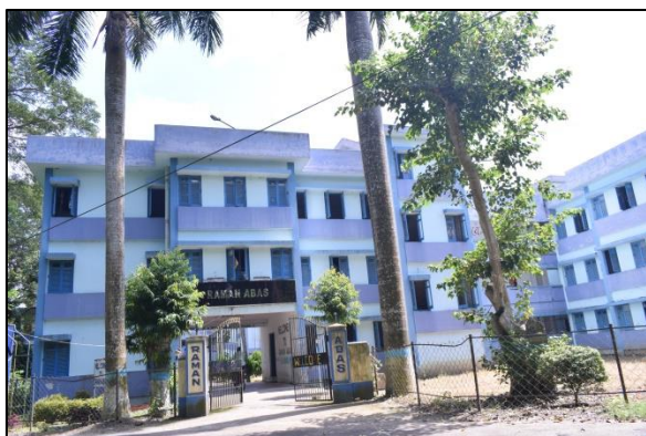
UG Boys Hostel Raman Abas

All the boarders shall abide by the following hostel regulations. Non-compliance with any regulation may lead to punishment such as expulsion from the hostel and even from the Viswavidyalaya.