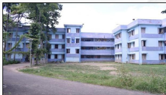
UG Boys Hostel J.C Bose Abas