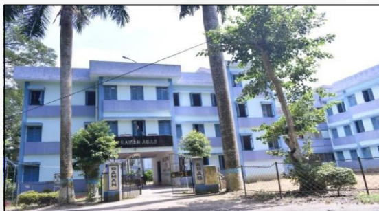
UG Boys Hostel Raman Abas

All the boarders shall abide by the following hostel regulations. Non-compliance with any regulation may lead to punishment such as expulsion from the hostel and even from the Viswavidyalaya.