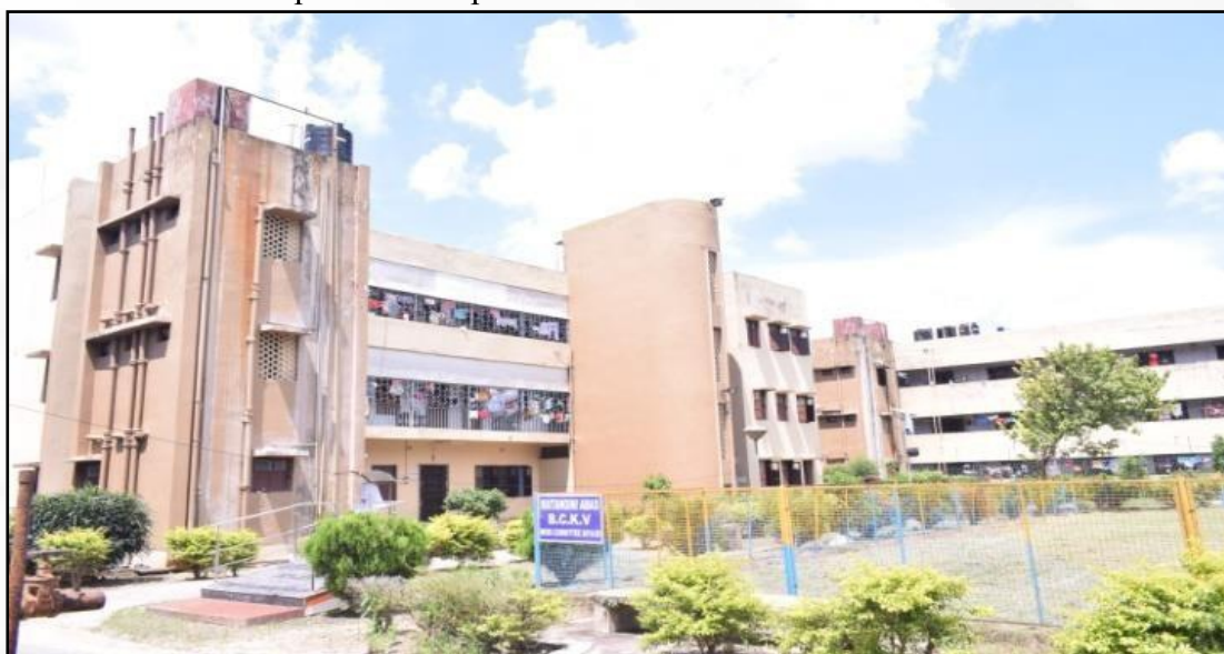
UG Girls Hostel Matangini Abas